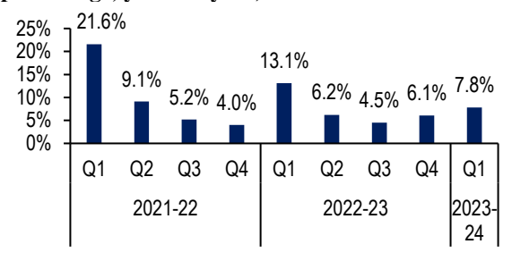
Figure 1: GDP growth at constant 2011-12 prices (in percentage, year-on-year)

Note: In first quarter of 2021-22, GDP had increased on a low base after contracting by 23.4% in first quarter of 2020-21. Sources: Ministry of Statistics and Programme Implementation; PRS.